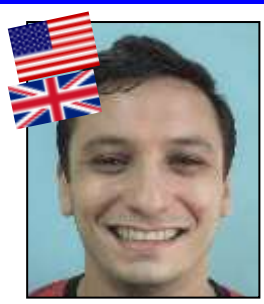
Julian Buck Elementary PE (G2-G6)