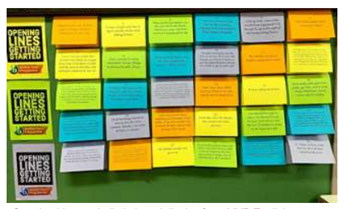
Opening Lines: a bulletin board display from MYP English Language and Literature

MYP students and teachers have worked hard to make the necessary adjustments. Students have been enthusiastic about being at school in person for the first time in many months. They have been conscientious about adapting to the routines requiring social distancing and heightened hygiene. Students have adapted quickly to the new schedule and have dealt effectively with the changes imposed by safety measures.